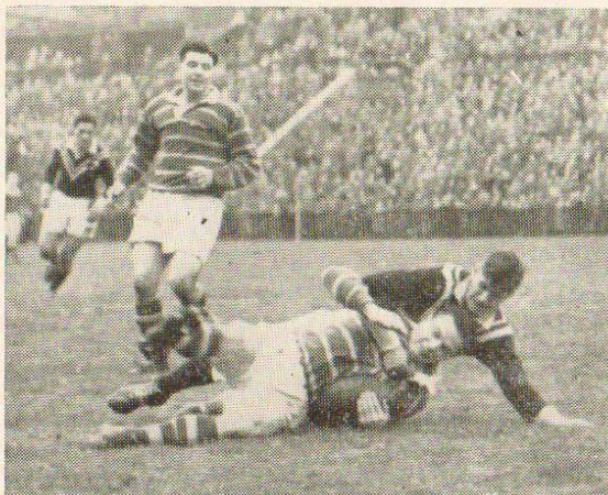
HUDDERSFIELD v. NEW ZEALAND