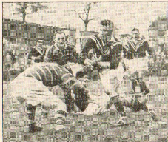
HUDDERSFIELD v. NEW ZEALAND

Ramsden goes in low for the tackle, with Wood awaiting the outcome